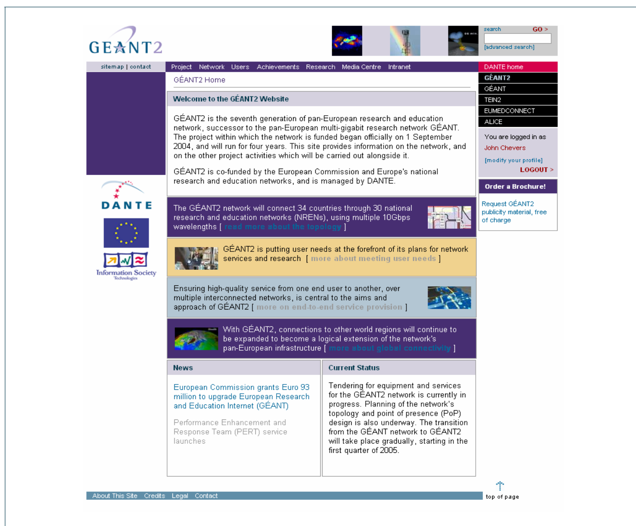
Figure B.1: GÉANT2 public website homepage

This appendix contains images of the homepages for the GÉANT2 public website and private project intranet.