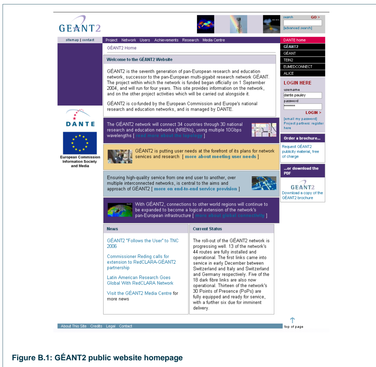
Figure B.1: GÉANT2 public website homepage