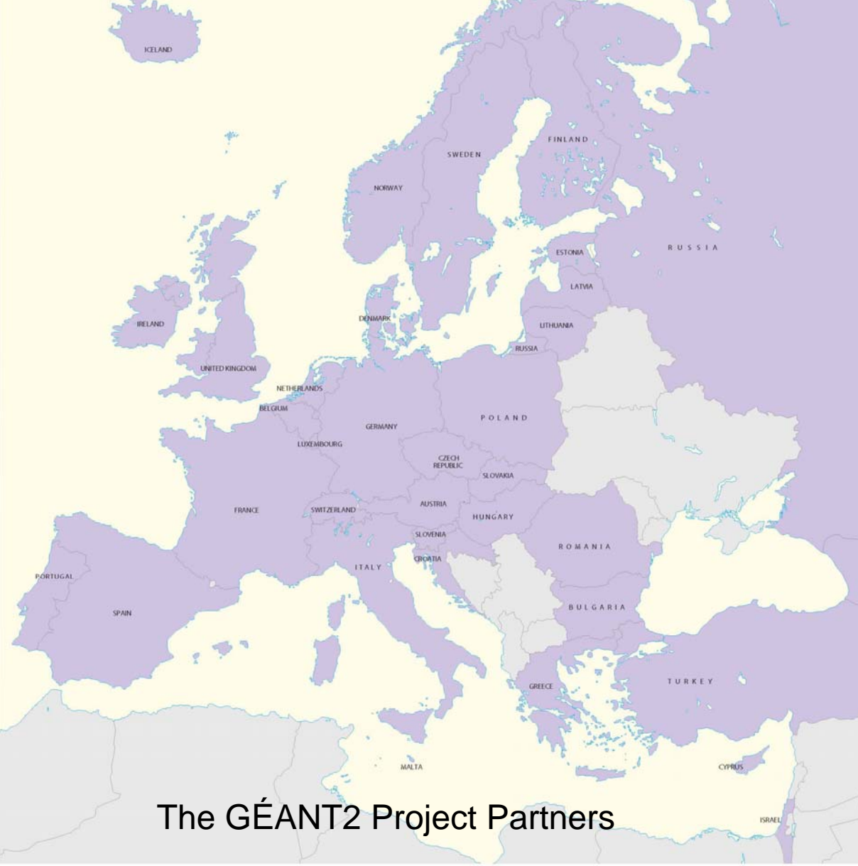
The GÉANT2 Project Partners